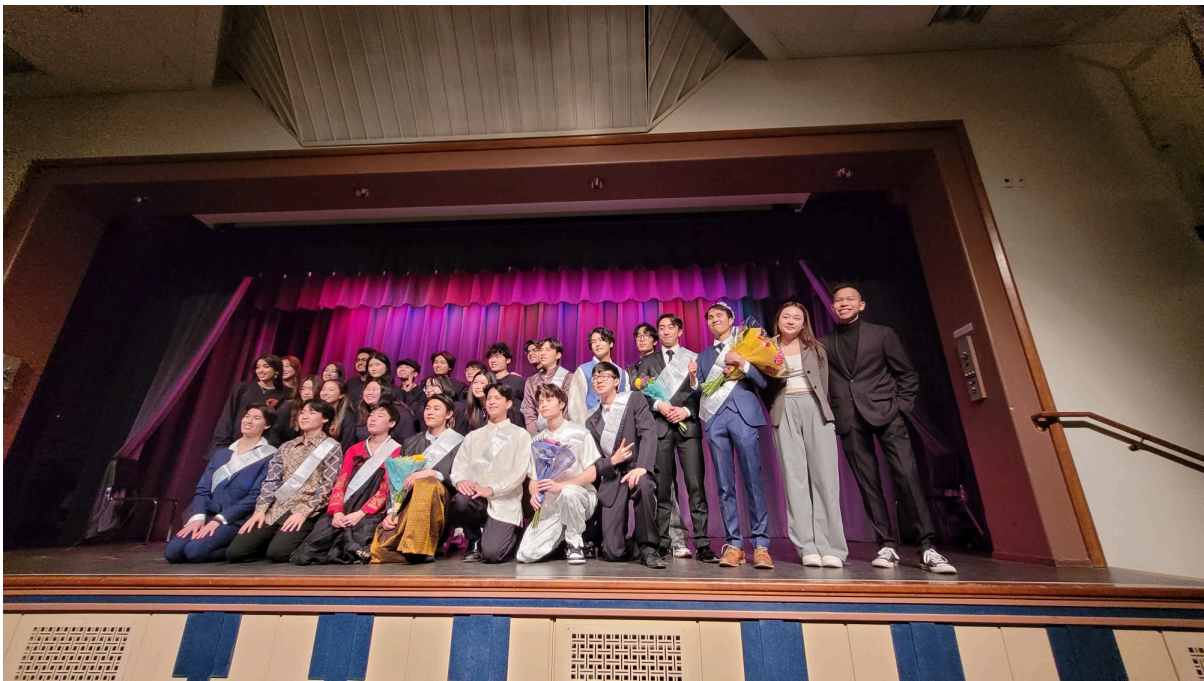
Congratulations to the Asian Student Union Board for hosting a successful Mr. Asia event on Saturday, March 4th, 2023!